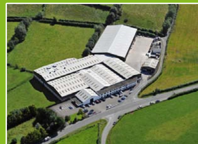
Production facilities of 500,000 sq feet located across 40 acres in Co.Antrim and Co.Tyrone. Left: Steeple, Top Right: Greystone Rd, Bottom Right: Benburb

Units 4-7 Steeple Road Industrial Estate, Antrim, Northern Ireland, BT41 1AB