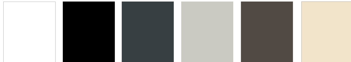
White (9910 high gloss) Black (9011 semi gloss) Grey (7016 matt) Silver Grey (7035 semi gloss) Brown (BS08-B29 semi gloss) Cream (BS08-B29 semi gloss)

Bi-fold doors can be coloured on one or both sides, and feature a matt or gloss finish depending on your chosen colour (other RAL colours available upon request):